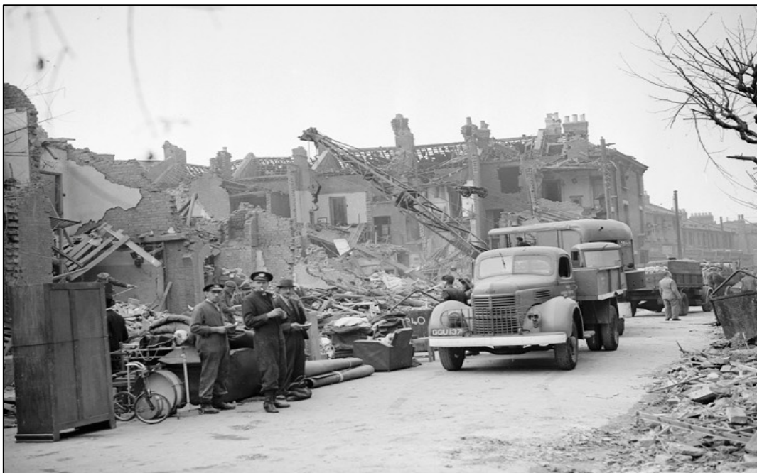
Direct hit on houses in East Ham

Saturday September 16, (+/- 07.00 hours) - Battery 444, Walcheren, Serooskerke, Vrederust, V-2 rocket fired, impacted East Ham. Direct hit on houses. Six people killed and fifteen seriously injured. Four Houses demolished. Pieces of the rocket remains were taken to the East Ham Police Station.