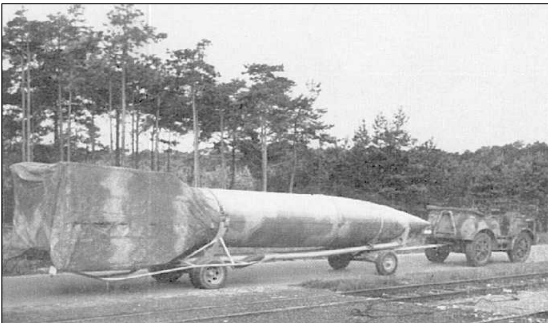
A V2 Rocket being transported to a launch area

Despite the great damage caused by the V2s, they were actually considered to be a failure as a weapon due to their poor accuracy, great expense and relatively small warhead size. Each V-2 cost 20 times more money to manufacture than a V1, and yet their warheads were almost the same size. The greatest value of the V2 was realized after the war, when captured V-2s were used by the United States and the former Soviet Union to begin their own missile and space programs.