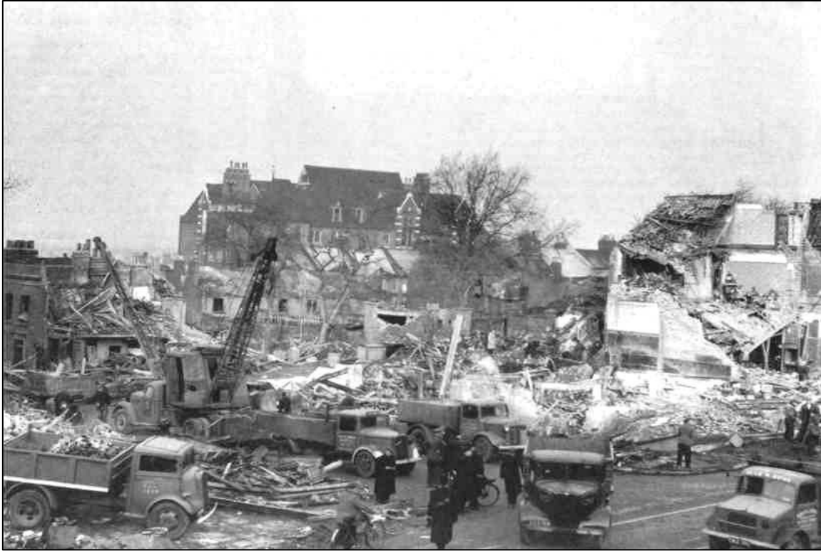
The destruction of the Woolworth's department store and other stores in Cross Road South London.